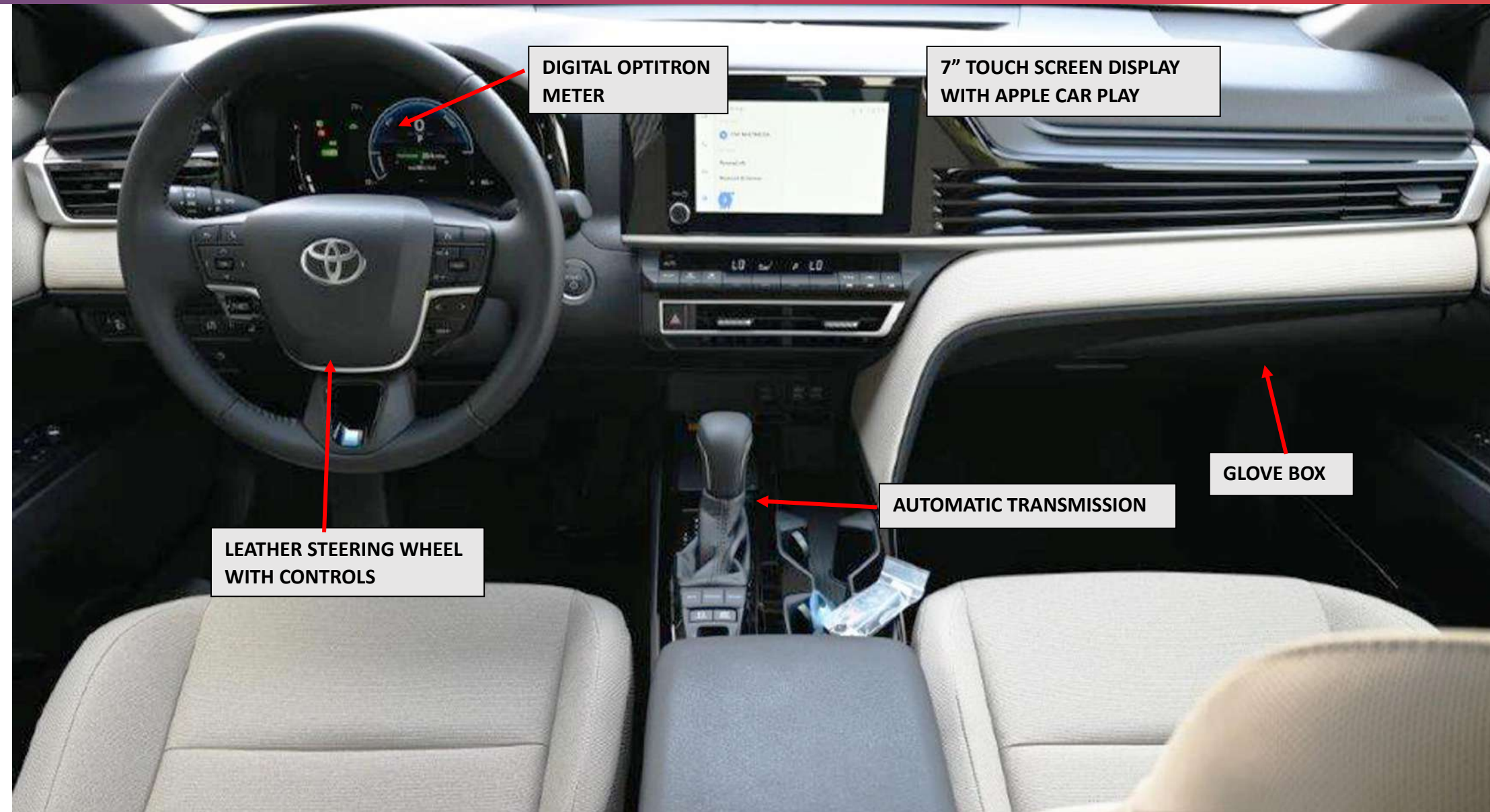
DIGITAL OPTITRON METER